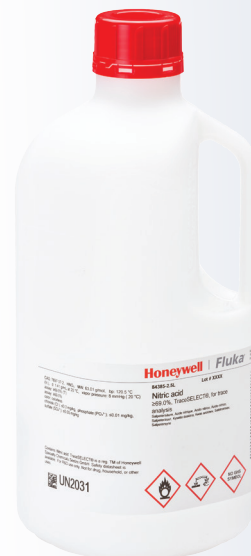
Honeywell Fluka - Nitric Acid TraceSELECT 84385-2.5L

The reduction of metals into mercury is more favourable than reduction to the solid-state electrode. Further on there is always a clean new Hg electrode surface available for each measurement.