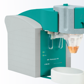
Multi-mode Electrode (MME)