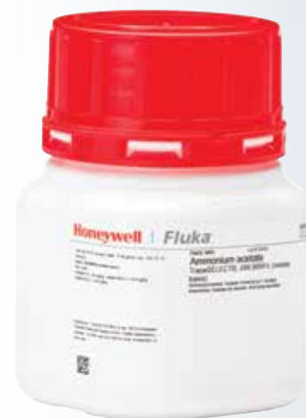
Honeywell Fluka - Ammonium Acetate TraceSELECT 73432-100G

For more information, visit: lab-honeywell.com/traceselect