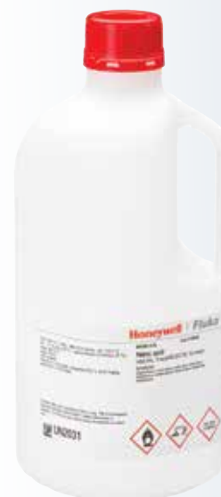
Honeywell Fluka - Nitric Acid TraceSELECT 84385-2.5L

The reduction of metals into mercury is more favourable than reduction to the solid-state electrode. Further on there is always a clean new Hg electrode surface available for each measurement.